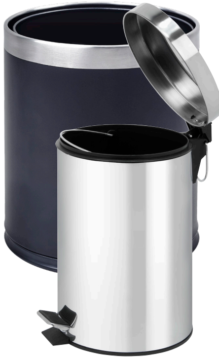
BIN SET 2