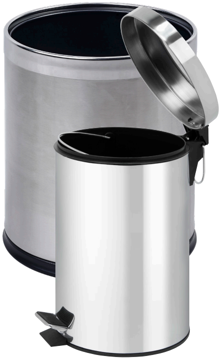
BIN SET 1